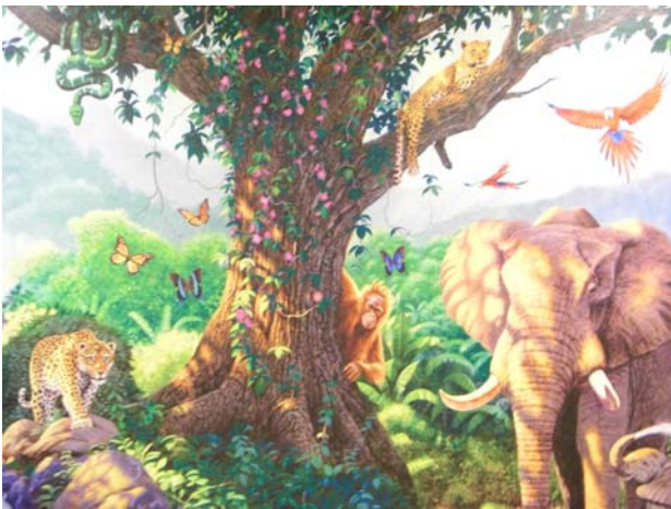
The Jungle Mural