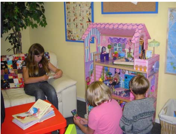
It's already being utilized!