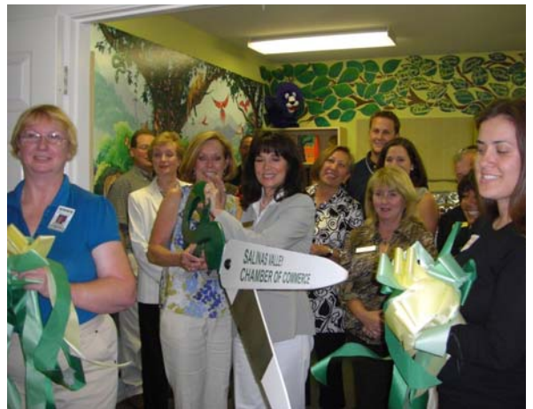
The Ribbon is Cut!