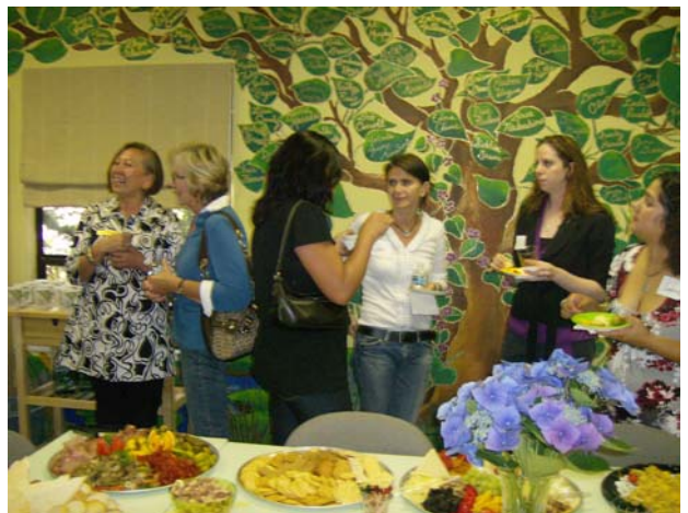
A glimpse of the Advocate Tree...